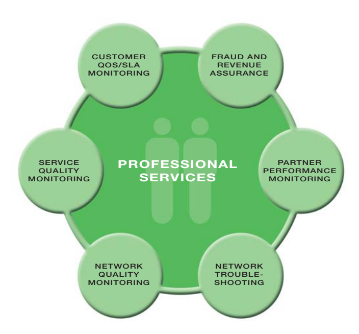
Our OSS solutions translate complex, technical data into understandable operational information so service providers can enhance their Quality of Service, increase their efficiency, and improve their profitability.