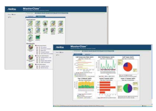
The MasterClaw™ VoIP solution from Anritsu gives you real-time Mean Opinion Scores. These represent the voice quality over your network using the internationally recognized 1-5 scale.

For decades, the telephone industry has invested in tried-and-true Circuit-Switched networks. And for many carriers, the large capital expenses have long since been amortized. Suddenly, new Packet-Switched Internet technologies can provide subscribers with high-quality telephony at unheard of low prices. What's more, the competition is heating up as new players take advantage of existing cable and data networks. Now the question is, who is strong enough to survive in the triple play world?